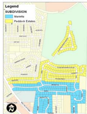
Paddock Estates and Marietta Subdivisions